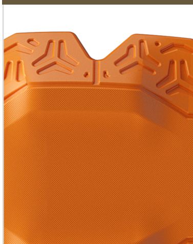
FLEX POINTS AND RELIEF CHANNELS