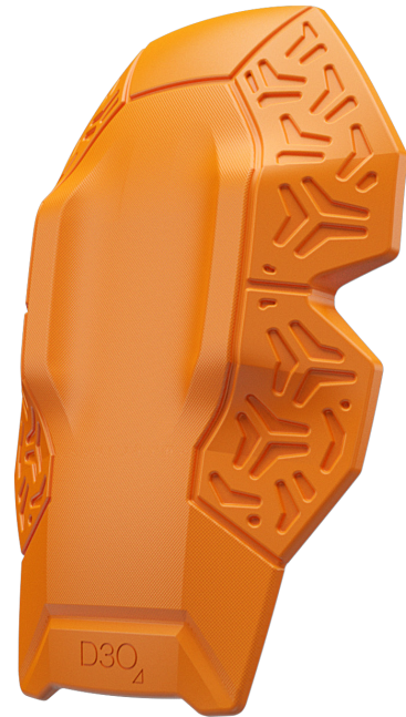
TRX™ KNEE PAD