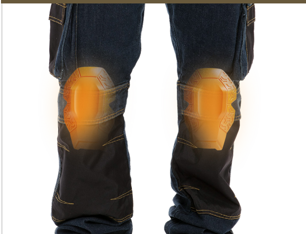
DESIGNED FOR SIMPLE INTEGRATION INTO EXISTING GARMENTS